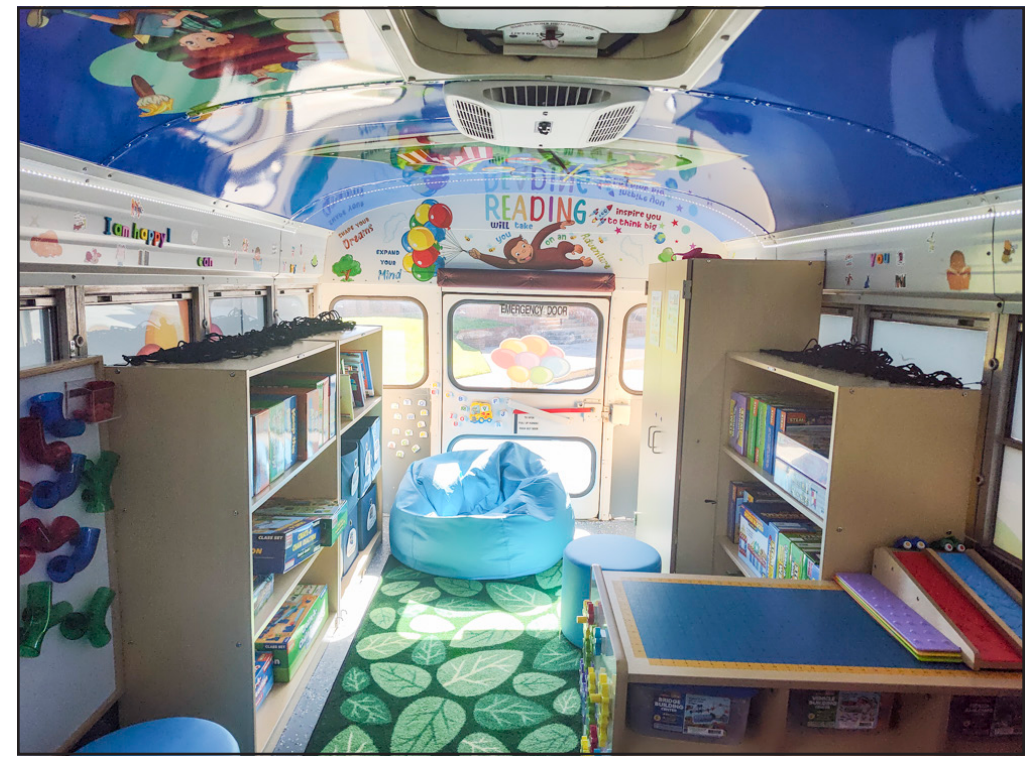
The new Literacy Bus has been ornamented to appeal to children, painted with a colorful outdoors scene on the outside and whimsically decorated inside. For a picture tour of the bus, visit the Towns County Schools Facebook page.

People who would like information on the STEM bus, including how to interact with the new learning tool as a member of the community, may contact stephaniemoss@ townscountyschools.org.